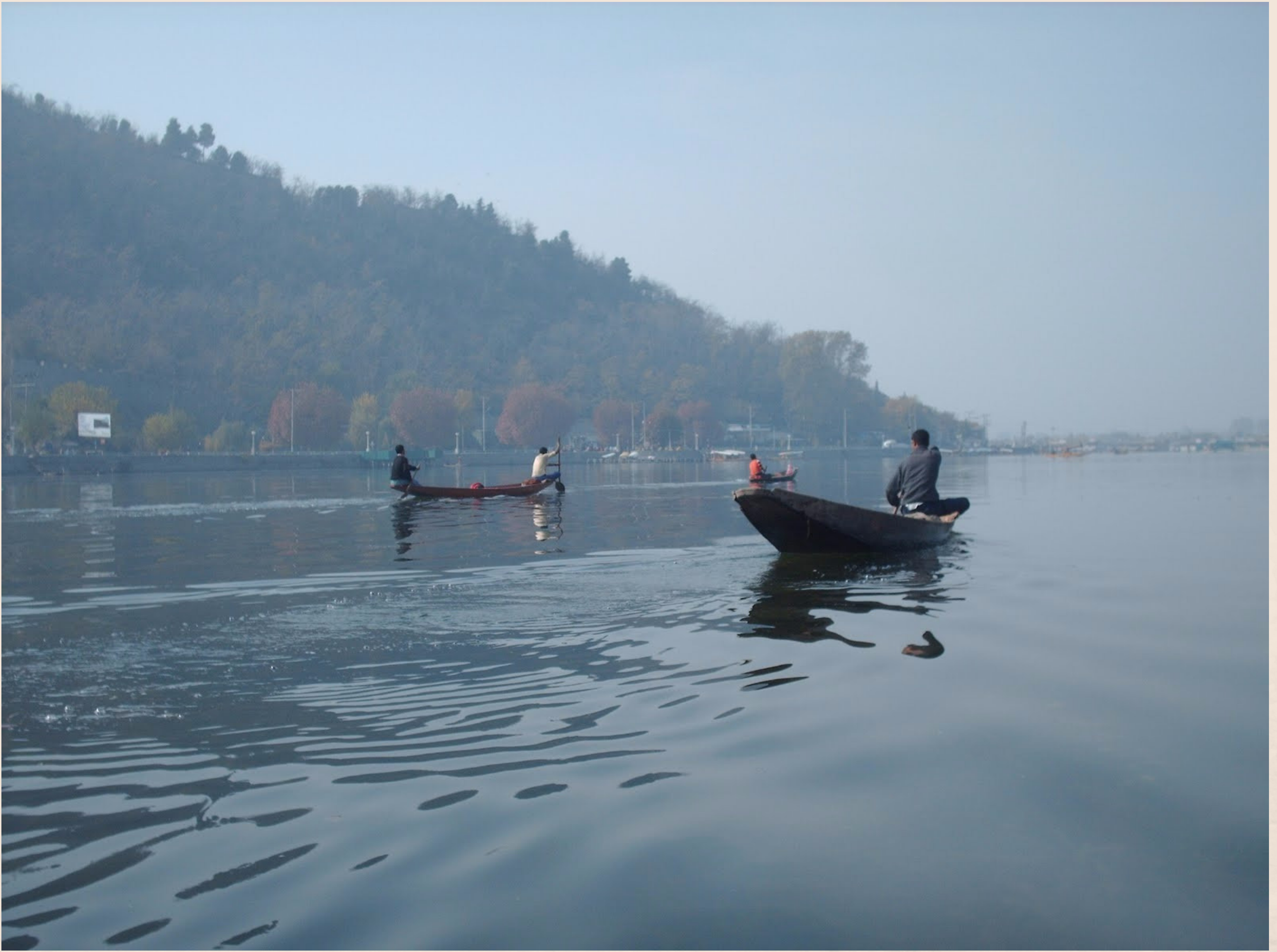
Locals glide along Dal Lake in summer.