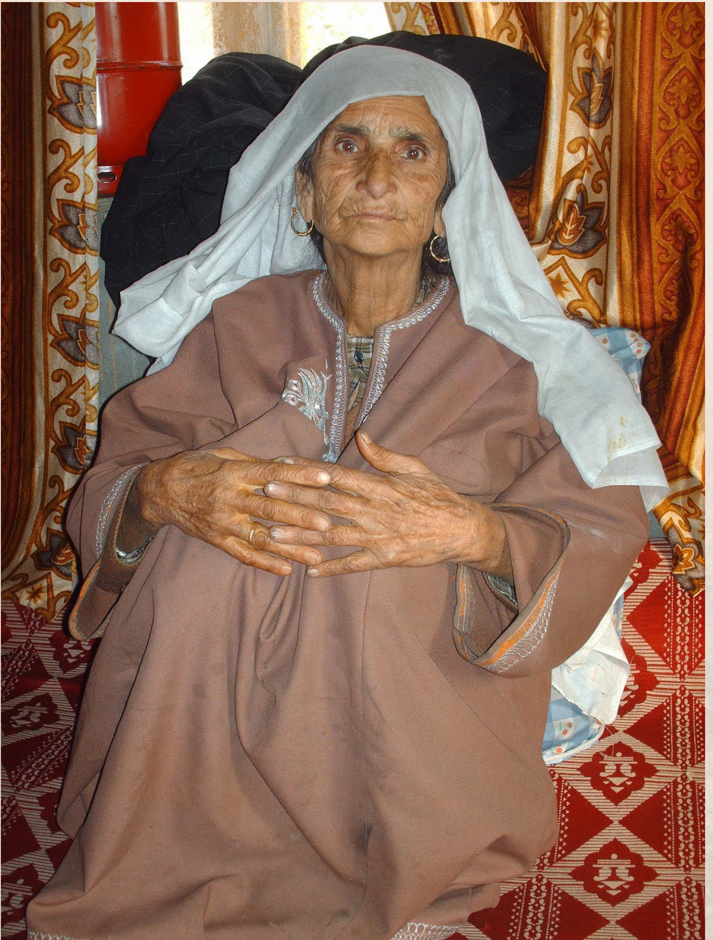
An elderly woman in a traditional Kashmiri dress. She lives on the outskirts of Srinagar.